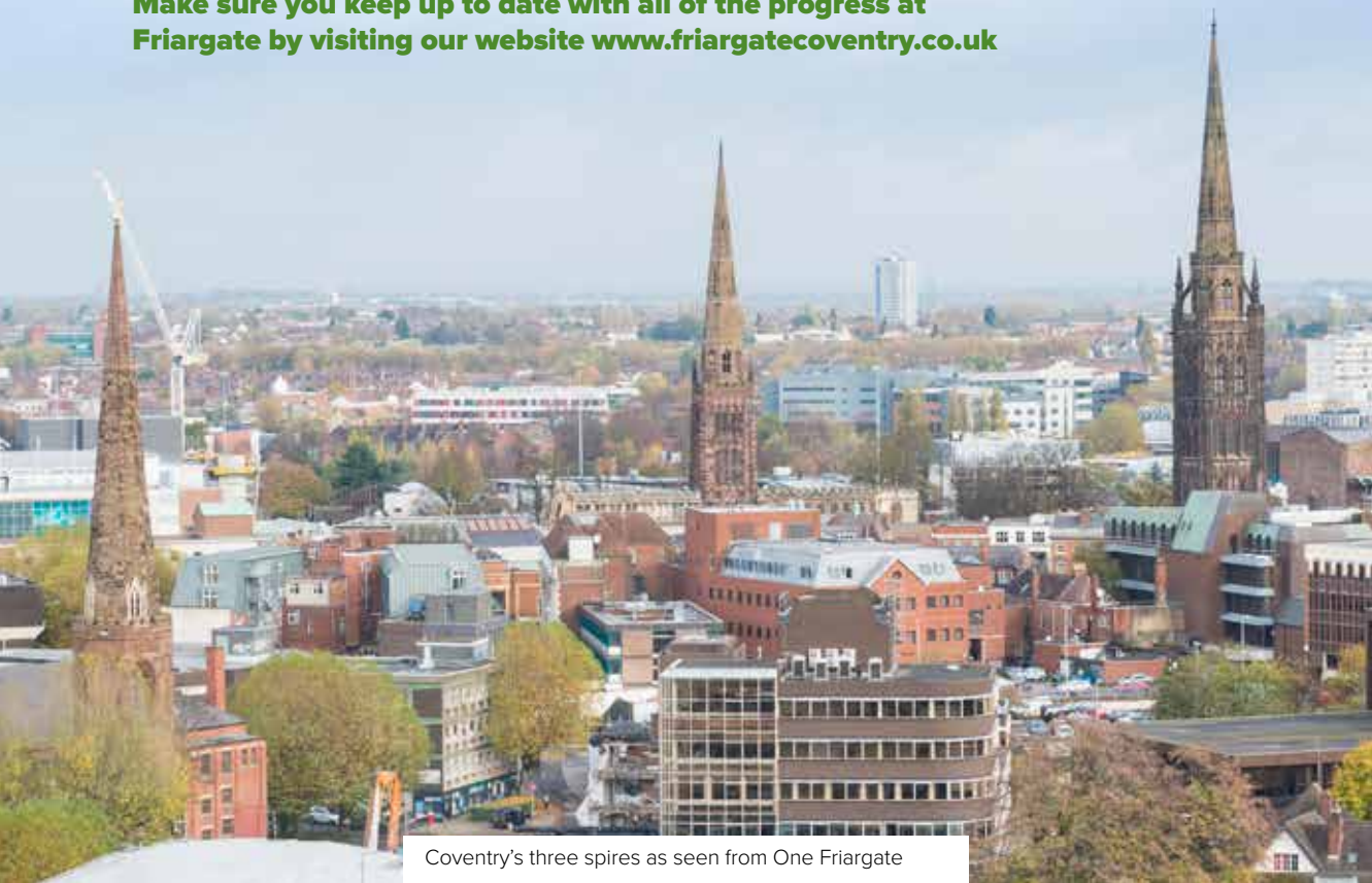
Coventry's three spires as seen from One Friargate

Make sure you keep up to date with all of the progress at Friargate by visiting our website www.friargatecoventry.co.uk