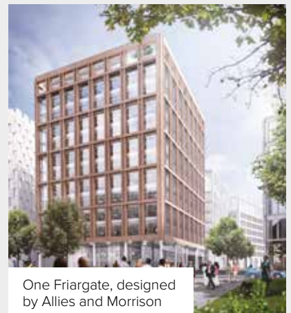
One Friargate, designed by Allies and Morrison

For all the latest building updates, make sure you watch our time lapse camera and videos: www.friargatecoventry.co.uk/latest-progress/timelapse/